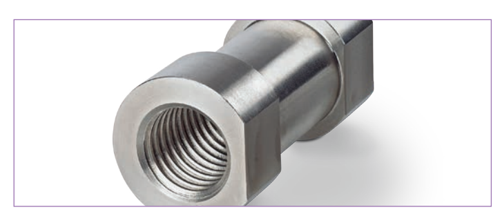
The 316 stainless steel inserts are over molded and keyed to prevent the bolts from twisting or pulling out.