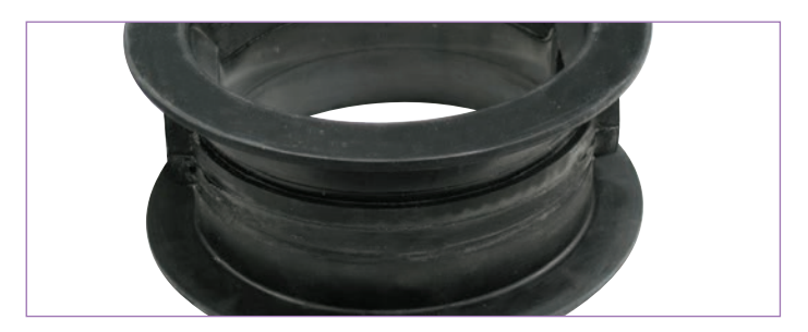
\label{thm:continuous} Traditional boot designs require higher torque, greater wear and have a tendency to swell.