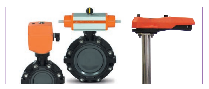
There is a complete line of both electric and pneumatic actuation available for the 578 butterfly valve. In addition, accessories are available such as positioners, manual override, limit switches, pilot valves and handle extensions.