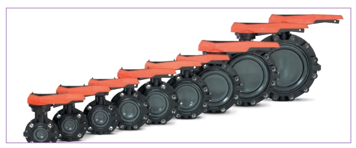
The 578 valve is available from 2" to 12", the wafer version is available up to 24".