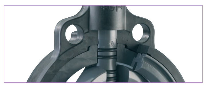
The 316 Stainless steel shaft is truly non-wetted and has redundant O-rings that ride in precision bushing assembly providing the highest level of reliability.