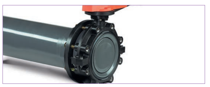
The 578 valve is designed to hold full pressure on either side of the valve while only one flange is present. This means one side of the system can be shut down for maintenance or expansion without having to depressurize the other side.