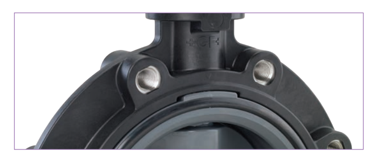
The non-wetted outer shell is a fully molded glass-filled PP, making it UV and chemically resistant, further protecting the piping system from the environment.